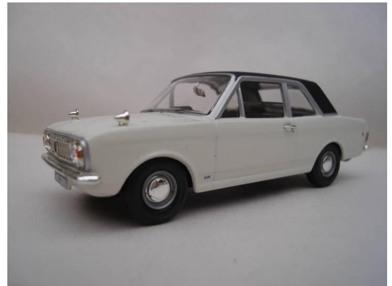
1966 Ford Cortina MK II GT No VA04100 In Ermine White with black vinyl roof by Vanguard.