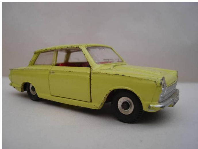
1965 Ford Cortina No 133 in Yellow by Dinky - with jewelled head and rear lights, opening doors, front tipping seats and number plates

Sources : "Diecast Collector" and "The World of Automobiles - An Illustrated Encyclopaedia of the Motor Car"