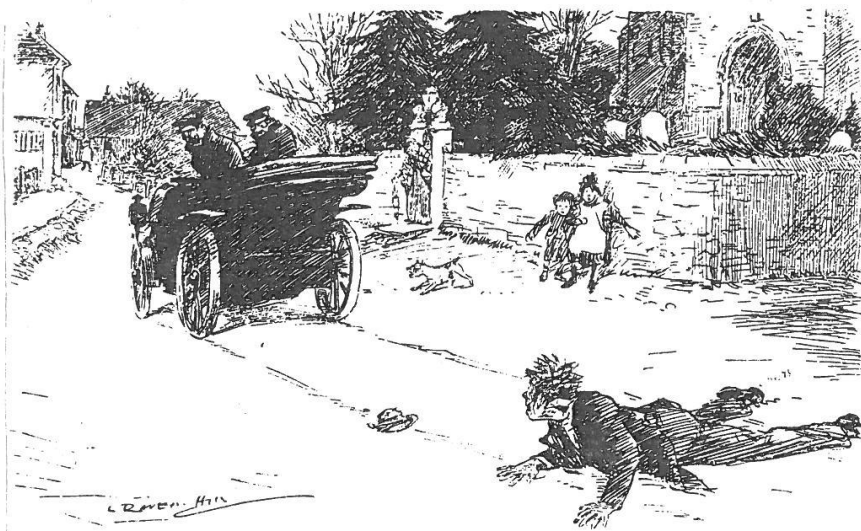
Motor Fiend: "Why don't you get out of the way?" Victim: "What! are you comin back?"