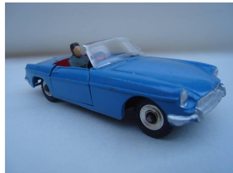
1962 MGB No 113 in blue with red seats by Dinky.