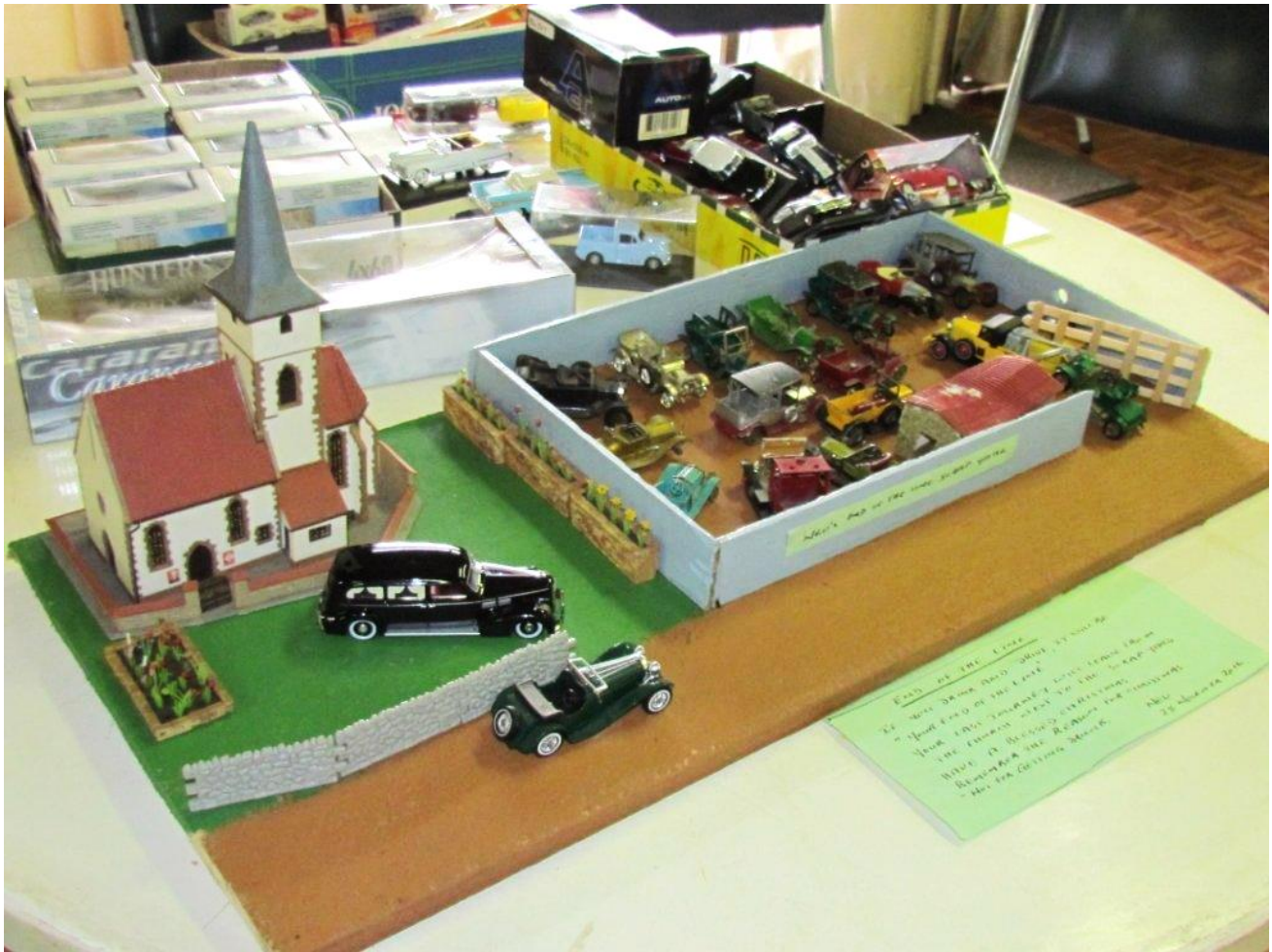
Neville Geddes (5 th Place) "The End of the Line" - showing a Church next to a scrap yard. This represents that if you drink and drive it will be your end of the line for both driver and car.