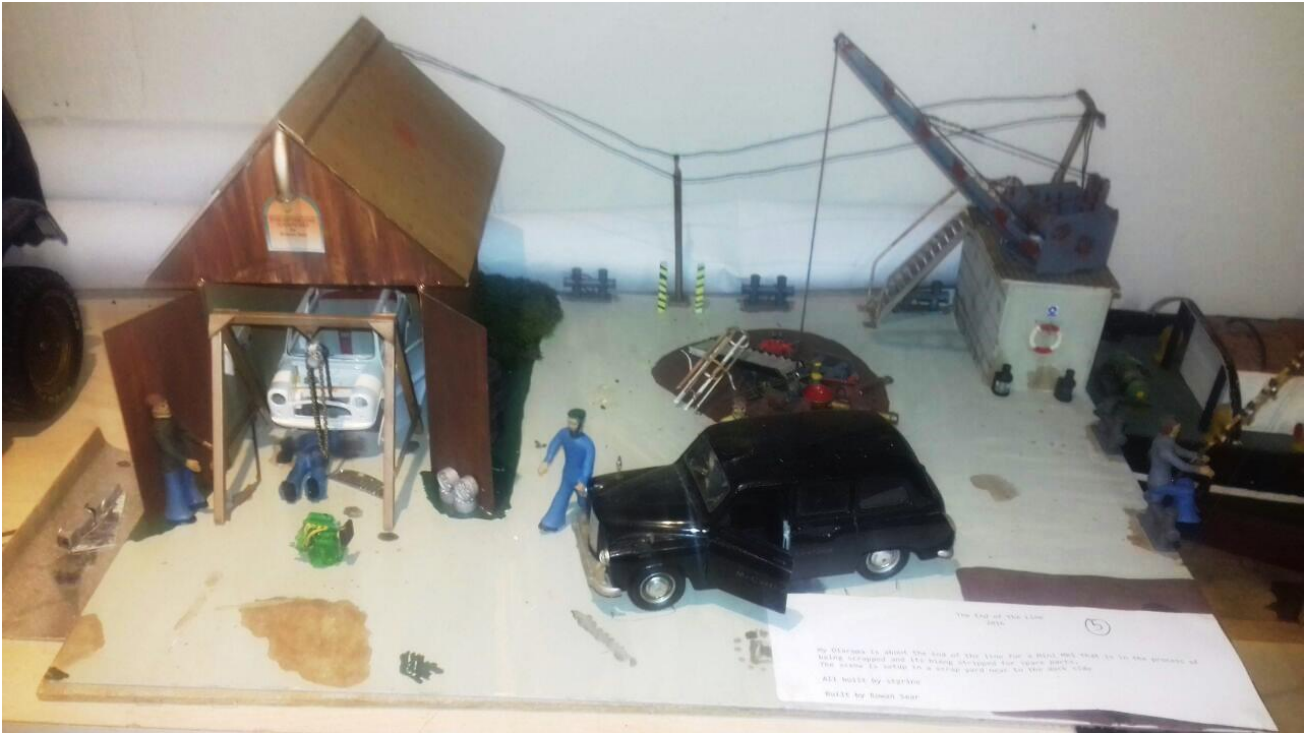
Rowan Sear (1 st Place) "The End of the Line" - shows the end of the line for a Mini Mk I that is in the process of being scrapped, and is being stripped for its spare parts. The scene is set-up in a scrap yard near to the dockside. All material used is styrene.